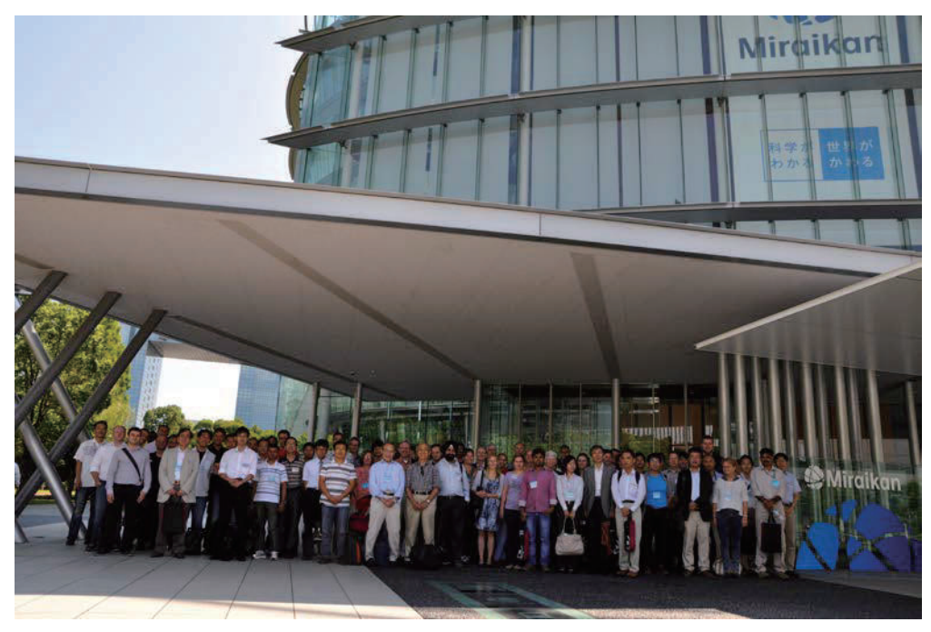
Fig. 1: Photo of conference attendees

More than 77 participating scientists from 17 countries (Belgium, Canada, China, France, Germany, India, Italy, Japan, Korea, Pakistan, Poland, Romania, Russia, South Africa, Switzerland, UK, USA), met in Tokyo to present over 67 scientific contributions covering the wide field of "State-of-the-art Technologies for Nuclear Target and Charge Stripper". A laboratory tour of the RIKEN RI Beam Factory was included in the scientific program to introduce the institution and laboratories. The conference comprised eleven different sessions titled ,"Targets and strippers for RIBF", "Classical accelerator targets", "RI beams", "Gas strippers", "Liquid strippers", "Production targets", "Medical and industrial applications", "Radioactive targets", "Target characterization", "Liquid and gas targets", "Radioactive targets", and "Laser-related targets". The sessions included many activities such as the discussion of exciting new developments or methods, reports on improvements of established techniques, presentation of scientific results by young scientists, and the introduction of new groups and laboratories in the society.