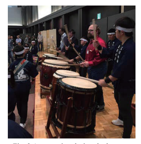
Fig. 2 An atraction during the banquet.

In the international organization committee meeting, it was decided that TCP2018 will be held in USA and organized by G. Bollen of MSU.