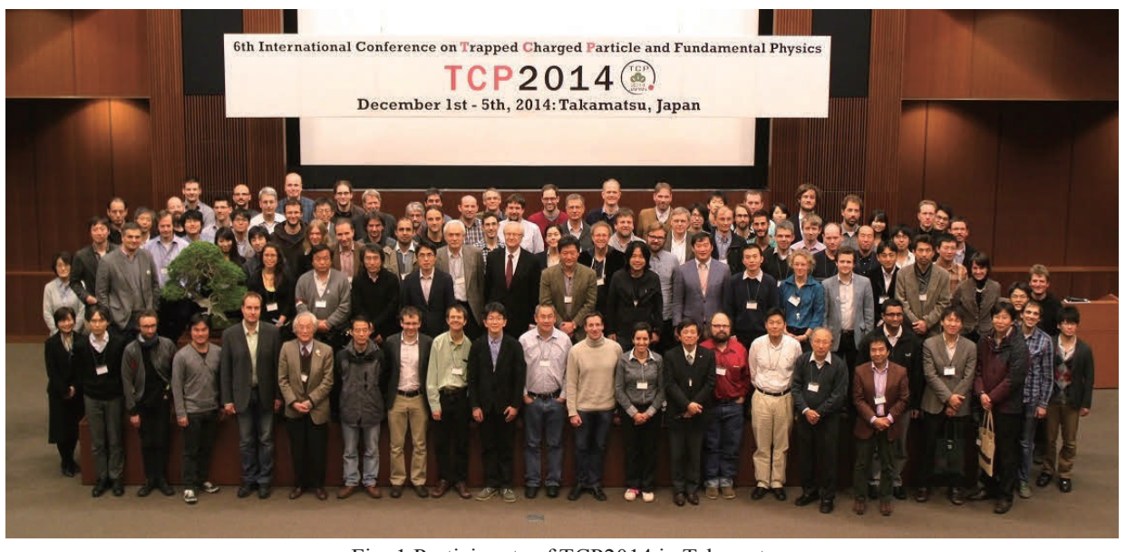
Fig. 1 Participants of TCP2014 in Takamatsu