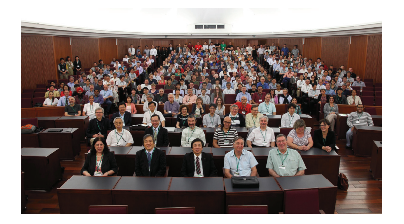
Fig. 1. Conference photo taken in the session hall.

The conference proceedings will be published electronically in the JPS Conference Proceedings Volume 6 (2015). The next ARIS conference will be jointly hosted by NSCL and TRIUMF.