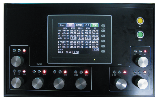
Fig. 2. Remote control interface for the new system.