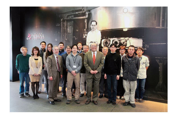
Fig. 2. Research group members after the conclusion of the naming meeting of the element 113.

right to name and determine the symbol for the element 113 in Dec. 2015. We proposed the name Nihonium with the symbol Nh. The name and symbol were finally accepted by IUPAC in Nov. 2016. Figure 2 shows the group members who participated in the naming meeting.