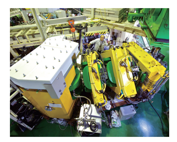
Fig. 3. Photograph of the GARIS-II separator. The separator has a Q-D-Q-Q-D configuration.

Aiming to discover further new elements, a new Gasfilled Recoil Ion Separator (GARIS-II) for asymmetric reaction such as hot fusion reaction was developed. GARIS-II has a large angular acceptance (18.5 msr) and short path length. The transmission of GARIS-II is 1.7 times higher than that of the present GARIS. New element search using the hot fusion reaction will be started in the near future at RIKEN Nishina Center.