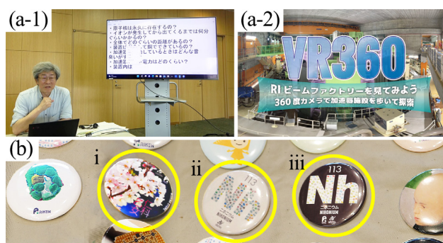
Fig. 3. (a-1) Online tour using RIBF-VR360 with a navigator for interactive communication. (a-2) the title page (b) three badges marked with yellow circles were designed by Nishina Center. The flowering plant in (i) is the “Nishina Otome” cherry blossom produced in this center. The symbol “Nh” in (ii) and (iii) stands for the element Nihonium, that was synthesized in the center for the first time in the world.

tours titled “ Everything you want to know about state-of-the-art accelerator is right here! ” were held twice in the morning and also twice in the afternoon. The tour attendance was limited to 12 visitors, who were escorted by RIKEN staff members between the AH bldg. and the RIBF bldg., so that each group tour finished within an hour. The participants were welcomed at Cyclopeda for an explanation by the Nishina staff instructors, and then enjoyed the views of SRC and BigRIPS from the MB2 floor with guidance by the other instructors. At the end of the tour, they got RIBF souvenirs and left with the RIKEN staff members.