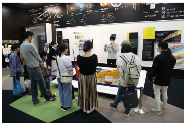
Fig. 1. Group tour to the Nishina Center RIBF bldg., including an explanation session at Cyclopeda followed by visits to SRC and BigRIPS.

The contents of the activities from Nishina Center were (1) group tours for Cyclopeda and RIBF (Fig. 1), (2) exhibition of a large photo panel of the Superconducting Ring Cyclotron (SRC) at the AH bldg. as well as a poster presentation (Fig. 2), and (3) an online laboratory tour with a navigator to the Nishina accelerators using RIBF-VR360 (Fig. 3(a)). 1) Online movies made before 2022 were also available. These contents included collaborations with the Center for Nuclear Study (CNS) at University of Tokyo and the Wako Nuclear Science Center (WNSC), IPNS, KEK. A tin-badge event was held at the AH bldg., in which visitors could make badges by themselves. The badges related to the Nishina Center, as shown in Fig. 3(b), were well-received by the participants. The details of the various activities are in Figs. 1 and 2.