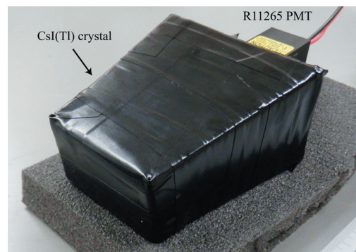
Fig. 2. Photograph of the prototype CsI(Tl) crystal.