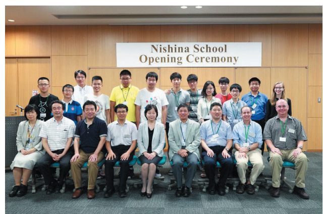
Fig. 2. Photograph of the Nishina School 2015 participants.