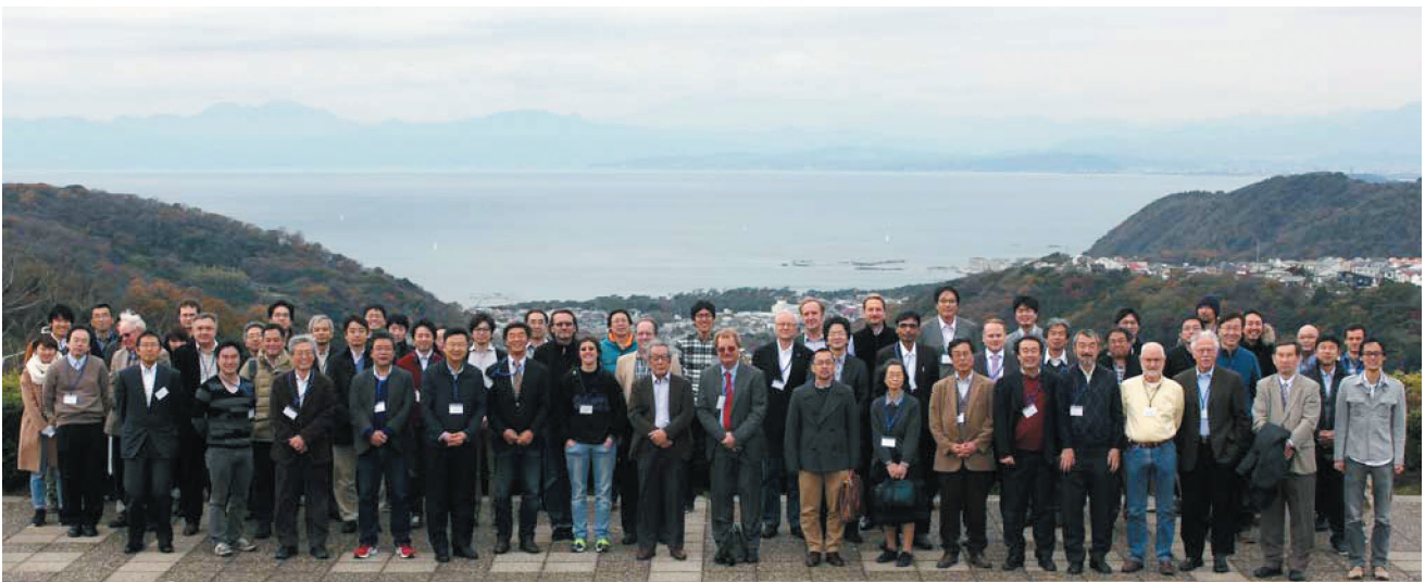
Fig. 1. Group photograph of the symposium