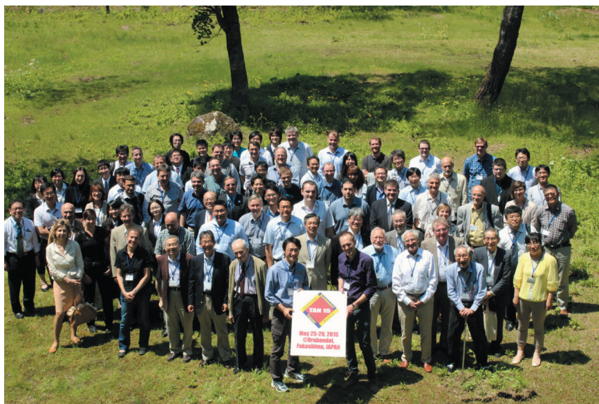
Fig. 1. Conference photo taken at a garden of the Urabandai Royal Hotel.

The next TAN conference will be organized by the German colleagues in 2019.