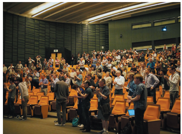
Fig. 2. Applause at the time of the conference end