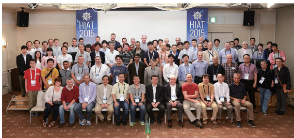
Fig. 1. Conference photo taken in the plenary hall