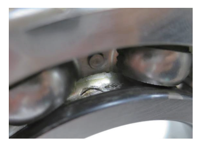
Fig. 2. Damaged bearing unit, disassembled from the anti-coupling side of the motor unit.